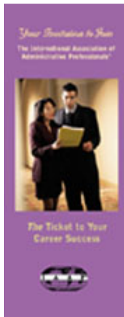
General Membership Information